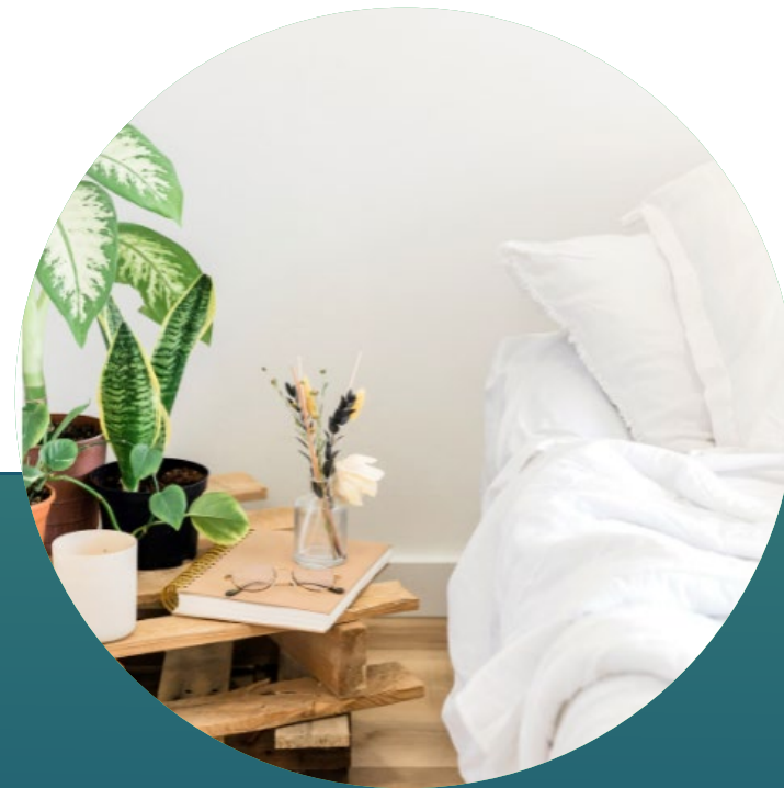
MATTRESS & BEDROOM