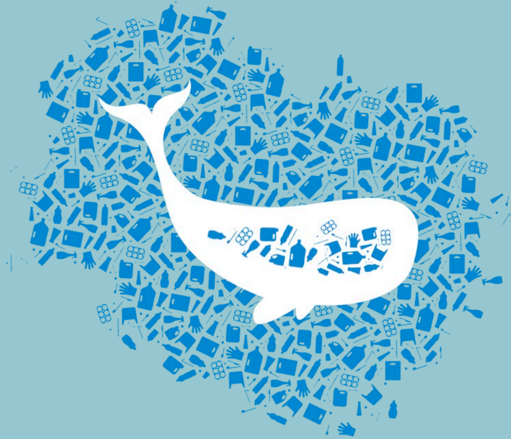
MICROPLASTICS IN THE BODY